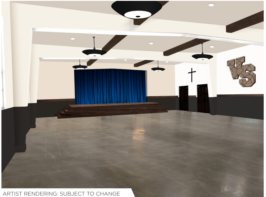
ARTIST RENDERING: SUBJECT TO CHANGE

Phase 5. Finally, with all of those needed repairs done, we will turn our attention to the church itself and all of the refurbishment that it needs. Pews, painting, carpet, chandeliers, artwork and statue cleaning, polishing of terrazzo flooring, etc. We are saving the church for last phase, as it is the one building that does not require immediate attention.