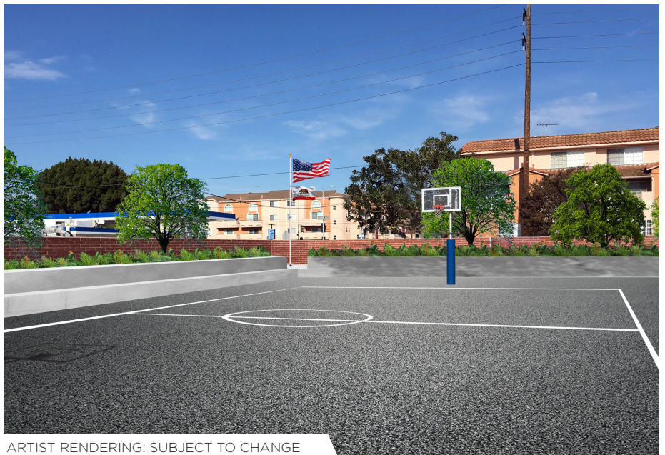
ARTIST RENDERING: SUBJECT TO CHANGE