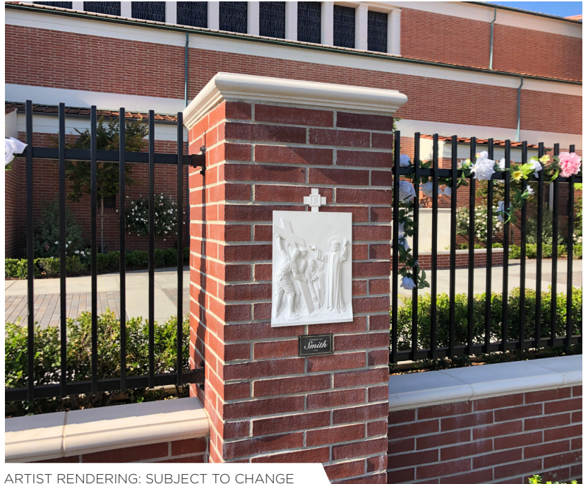
ARTIST RENDERING: SUBJECT TO CHANGE