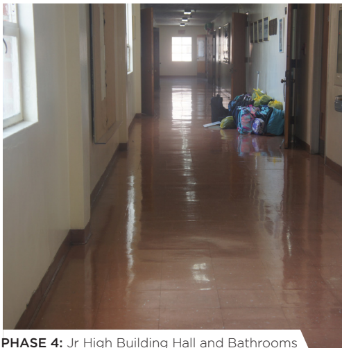
PHASE 4: Jr High Building Hall and Bathrooms