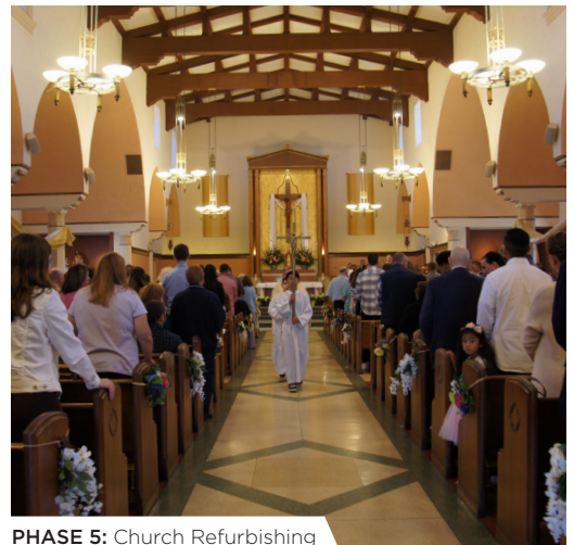
PHASE 5: Church Refurbishing